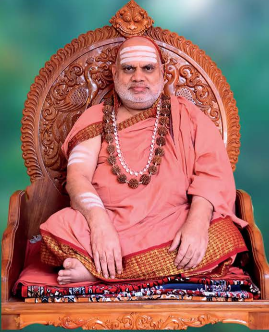
JAGADGURU SHANKARACHARYA SRI SRI BHARATI TIRTHA MAHASANNIDHANAM