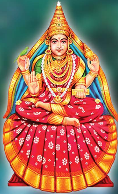
SRINGERI SRI SARADAMBA