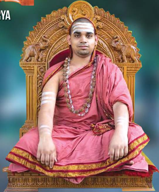
JAGADGURU SHANKARACHARYA SRI SRI VIDHUSEKHARA BHARATI SANNIDHANAM