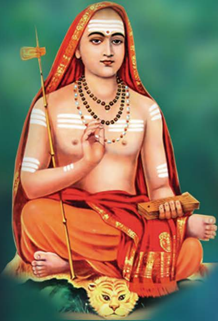
SRI SANKARACHARYA SWAMIGAL